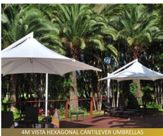
4M VISTA HEXAGONAL CANTILEVER UMBRELLAS