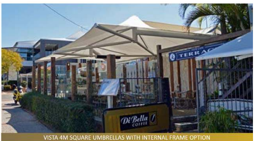
VISTA 4M SQUARE UMBRELLAS WITH INTERNAL FRAME OPTION