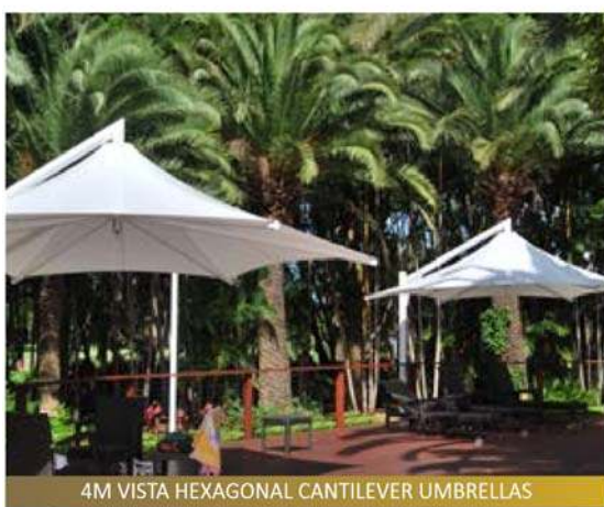
4M VISTA HEXAGONAL CANTILEVER UMBRELLAS