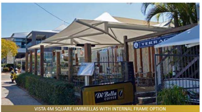
VISTA 4M SQUARE UMBRELLAS WITH INTERNAL FRAME OPTION