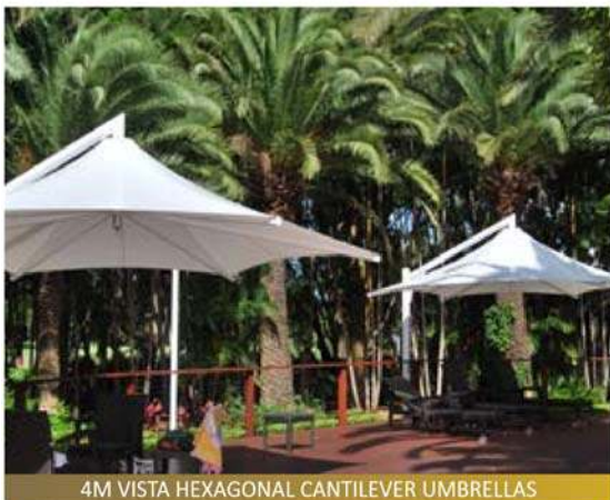
4M VISTA HEXAGONAL CANTILEVER UMBRELLAS