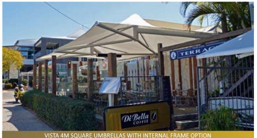
VISTA 4M SQUARE UMBRELLAS WITH INTERNAL FRAME OPTION