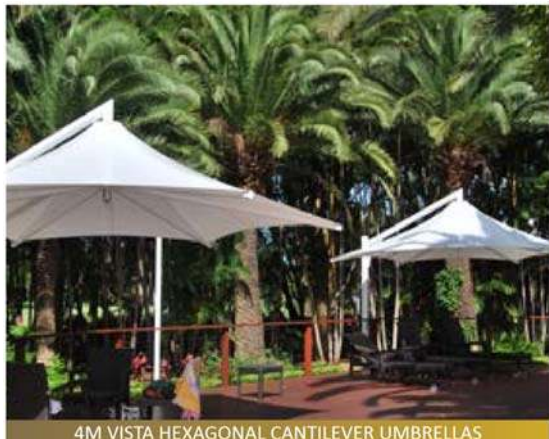
4M VISTA HEXAGONAL CANTILEVER UMBRELLAS