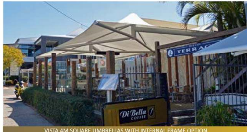
VISTA 4M SQUARE UMBRELLAS WITH INTERNAL FRAME OPTION