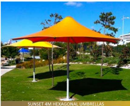
SUNSET 4M HEXAGONAL UMBRELLAS