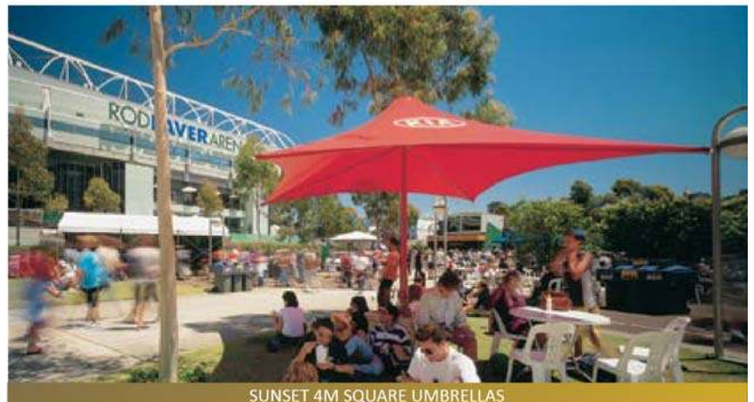
SUNSET 4M SQUARE UMBRELLAS