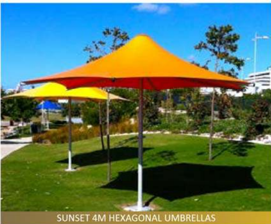
SUNSET 4M HEXAGONAL UMBRELLAS