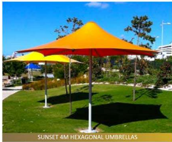
SUNSET 4M HEXAGONAL UMBRELLAS