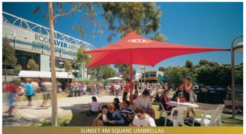
SUNSET 4M SQUARE UMBRELLAS