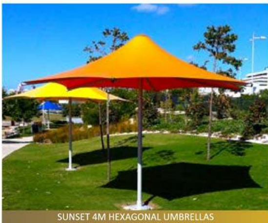
SUNSET 4M HEXAGONAL UMBRELLAS