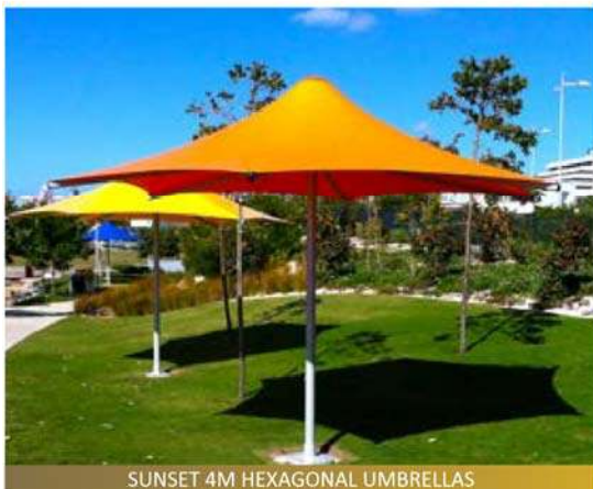
SUNSET 4M HEXAGONAL UMBRELLAS