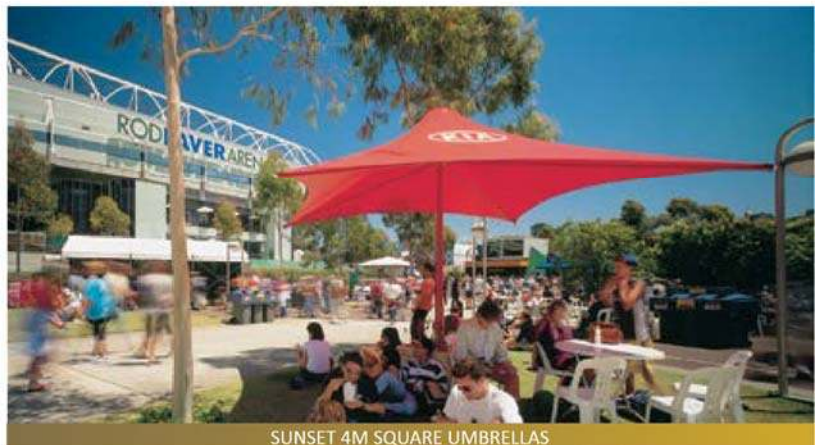
SUNSET 4M SQUARE UMBRELLAS