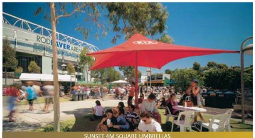
SUNSET 4M SQUARE UMBRELLAS