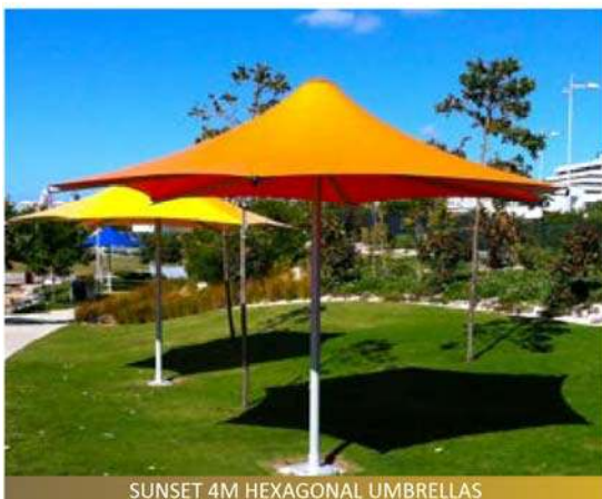
SUNSET 4M HEXAGONAL UMBRELLAS