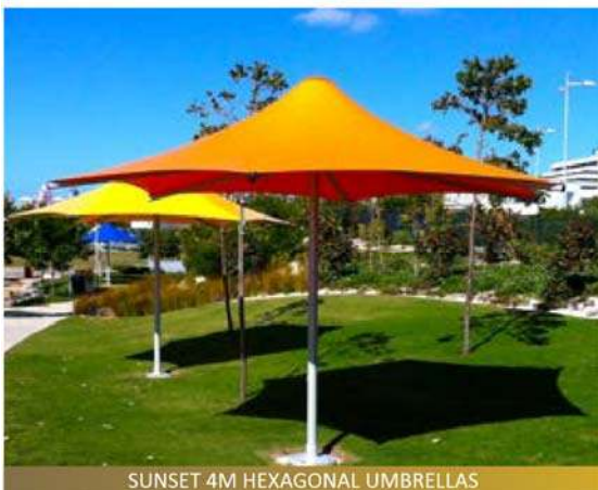
SUNSET 4M HEXAGONAL UMBRELLAS